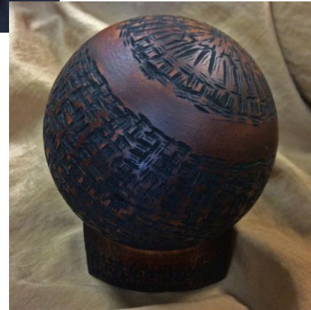
Carved Cherry Ball with Milk Paint

Finishing Deft wood finish lacquer Krylon clear acrylic coating- Matte, Satin, Semi-gloss Waterlox