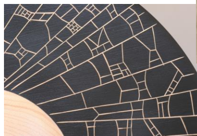
Carved painted Maple platter