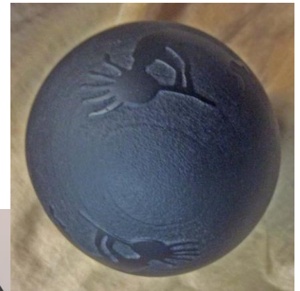
Sandblasted Maple ball with leather dye

Finishing Deft wood finish lacquer Krylon clear acrylic coating- Matte, Satin, Semi-gloss Waterlox